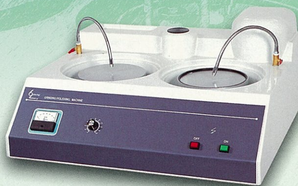
MODEL: P20FR P25FR