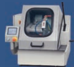
MSX250 Sectioning Machine