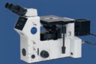
Olympus® GX-Series Microscopes

3000 Lakeview Avenue • St. Joseph, MI 49085-2396 • Phone: 800-292-6141 • Fax: 269-982-8977 info@leco.com • www.leco.com • ISO-9001:2000 • No. FM 24045 • LECO is a registered trademark of LECO Corporation.