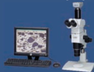
PAX-it™ Image Management System