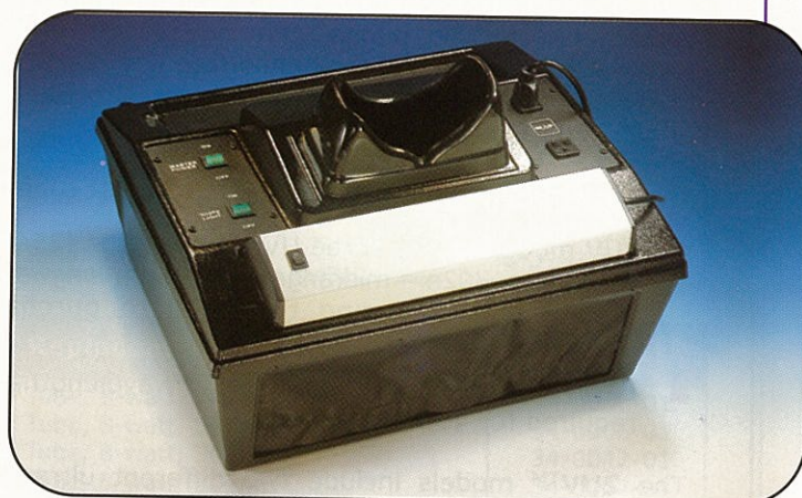
C-65 UV Cabinet is designed to accommodate one or two of the EL Series 8-watt Lamps