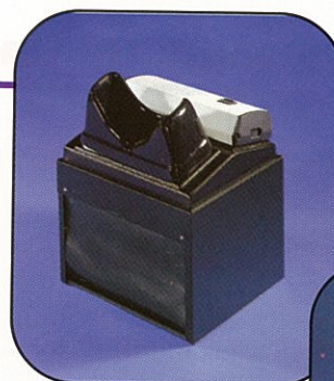
C-10E Mini UV Cabinet Designed for use with the 4-watt EL Series Lamps (see pages 21 - 22).