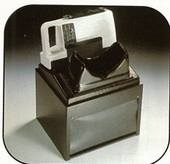
C-10P Mini UV Cabinet accommodates the 6-watt Rechargeable Lamps which are excellent for field use applications (see page 24 for Rechargeable Lamps).